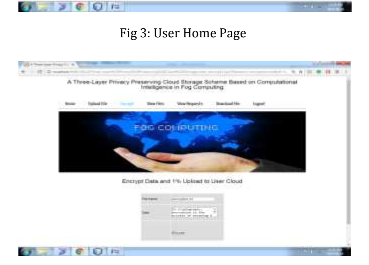
Fig 4: Encryption of File into Three Layer