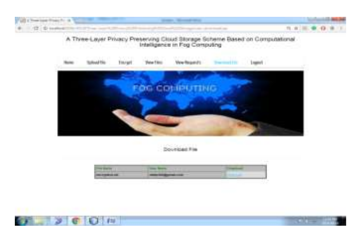
Fig 5: File Download