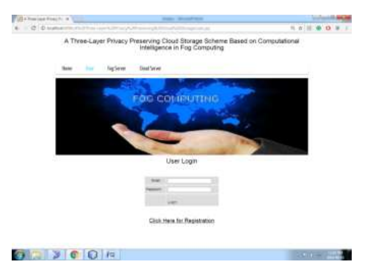
Fig 2:User Login