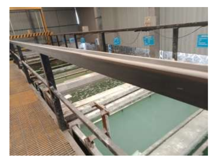
Fig 3: tanks for pre-treatment

International Research Journal of Engineering and Technology (IRJET)eVolume: 06 Issue: 07 | July 2019www.irjet.net