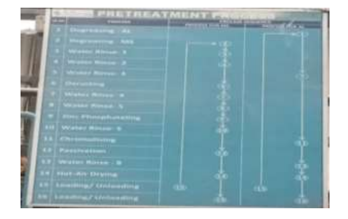
Fig 4: Process