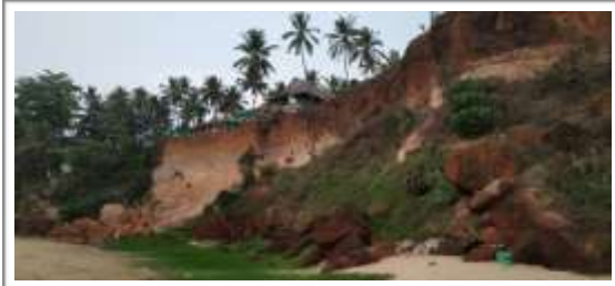
Fig - 4: Cliff image (Image taken from the study area)

cliff position over three particular years from satellite images and topographical maps using QGIS software and analyse the role of both natural and anthropogenic factors likely to drive cliff top retreat. The collapsed images of cliff is shown in the Fig- 4 below: