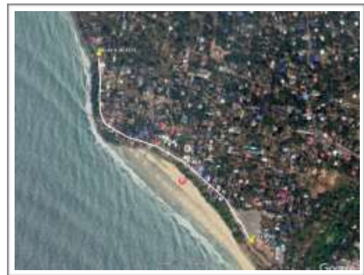
Fig - 3: Study Area

Varkala is an important place as Kerala Geology is concerned as it exposes sedimentary rocks found on Cenozoic age, popularly known as the Warkalli formation. The study area from Google Earth is shown in the Fig - 3 below: