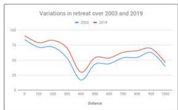
Chart - 1: Variations in retreat over 2003 and 2019

A graph is plotted showing the variation of cliff retreat over the years 2003 and 2019 from the year 1966 and is shown in the Chart - 1: