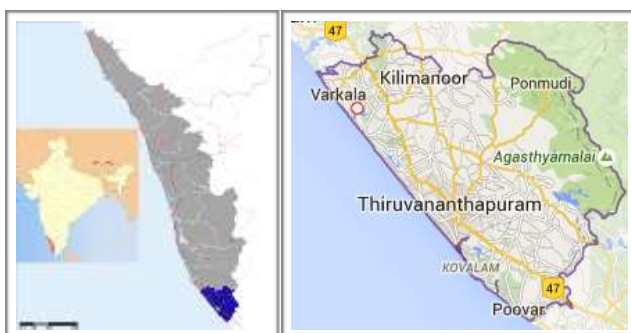
Fig-2: Location Map

Varkala is located 40 kilometres from Thiruvananthapuram which is the capital city of Kerala. The study area is shown in the Fig-2. Varkala is the only place in southern Kerala where cliffs are naturally formed adjacent to the Arabian Sea. Köppen-Geiger climate classification system classifies Varkala's climate as tropical monsoon. It has heavy rains during June–August due to a