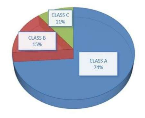
Fig 3: Total % of Cost

ABC Analysis provides a complete understanding of the different materials used in residential projects and their impact on the total project cost. It focuses on projects that achieve the greatest possible savings. Proper application of ABC Analysis in material management can reduce waste of materials in site.