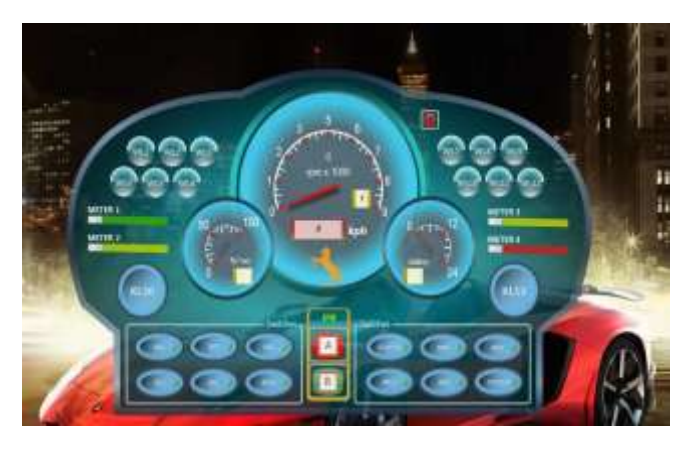
Fig- 3: Car Dashboard

Instrument Clusters provide basic driving information like speedometer, tachometer, temperature fuel, battery, and warnings. Additional information is presented via display, e.g. on-board computer, internet, navigation, rear or front view wheel speed sensor signals and driver assistance systems information.