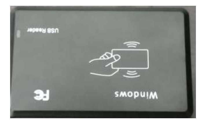
Fig 3-RFID Reader

ARDUINO - It is a microcontroller based upon ATmega328P.It act as a heart of all kinds of IOT projects. Even in this system it is the heart of system. It consists of 14 input/output pins,6 analog pins, a 16 MHZ (Mega Hertz) quartz crystal. It consists a USB connection through which code is uploaded on it and a power jack to supply power to it.