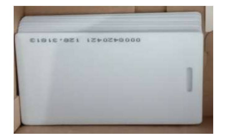
Fig 2-RFID Cards

RFID CARDS AND READER - RFID reader is used to read RFID tags which are embedded with RFID cards Radio frequency identification(RFID) uses electromagnetic to automatically identify and track tags attached to the objects. RFID cards (card number) contain electronically stored information. RFID reader to read the information encoded on a tag consist a two-way radio transmitter-receiver which emits a signal to the tag using antenna. The tag responds with the information written in its memory bank.