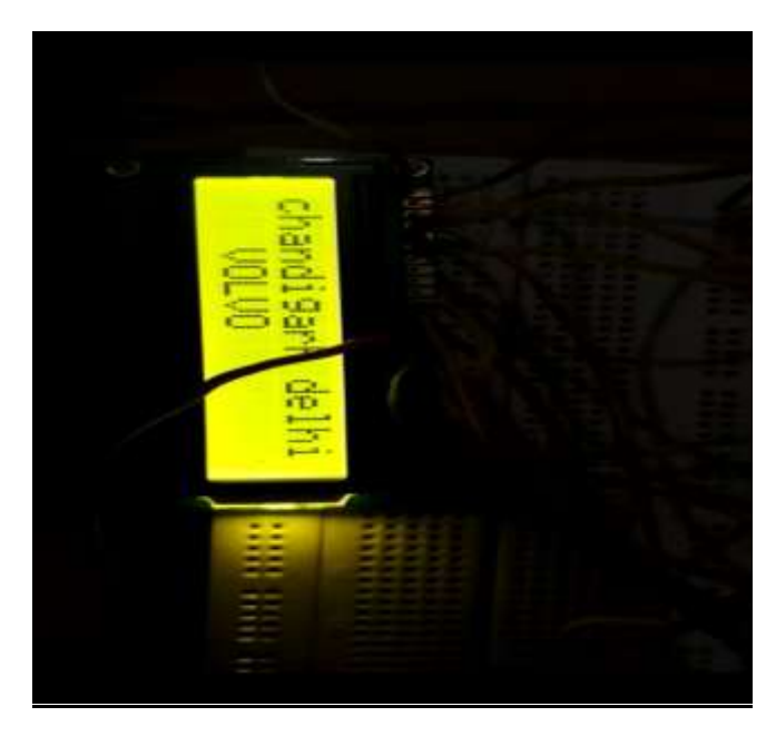
Fig 9- Snaps of Ticket Generator