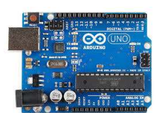
Fig 4-Arduino UNO

p-ISSN: 2395-0072 Arduino has its own compiler to upload code on Arduino.