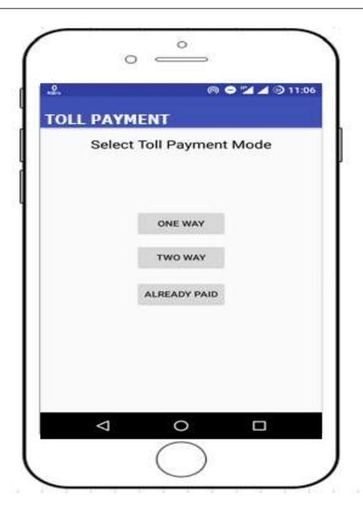
Fig.2: User mobile Application

Volume: 06 Issue: 07 | July 2019 www.irjet.net p-ISSN: 2395-0072