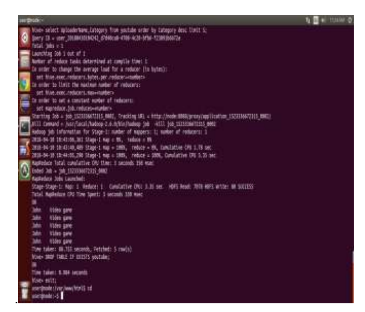
Figure 2. Screen-Shot-1

In the above screen shot, one can see that the processing of the data is carried out and information regarding how much of time taken for the processing and what information is processed is showing.