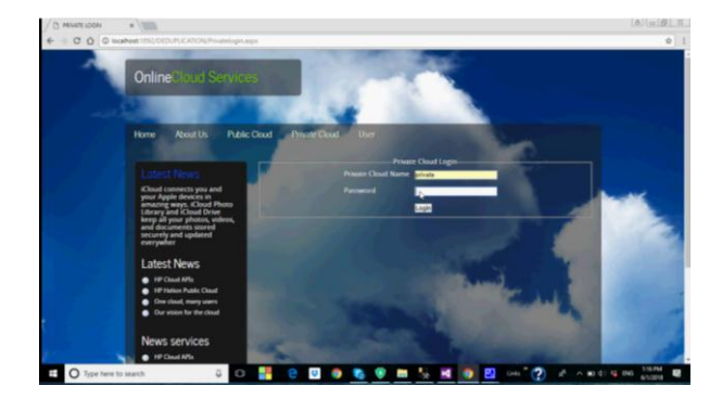
Fig-2.3 Private cloud Login

Description: creating convergent key for securing data deduplication where we get access to user Id details.