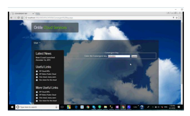
Fig-2.2 Entering Convergent key

Description: Page when we run the project where the authentication server provides authorized logins.