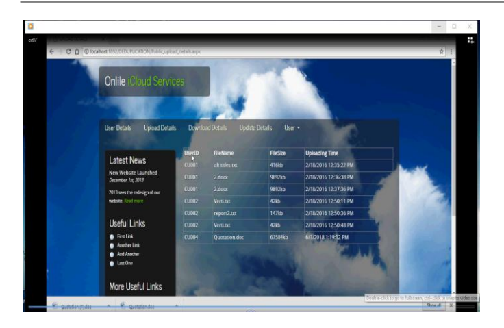
Fig 2.4 Document creation and data representation

Description: Document creation for security purpose after user access.