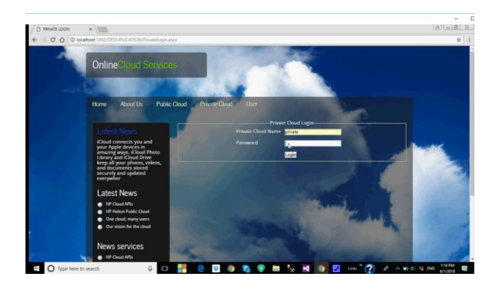
Fig-2.1: Cloud Login

Description: Page when we run the project where the authentication server provides authorized logins.