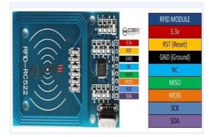
FIGURE 2.2 RC522 Module