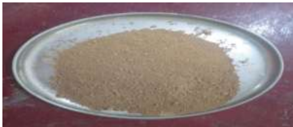
Fig 2.1.3 (a): Coconut Shell Powder