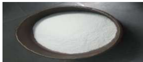
Fig 2.1.2 (a): Egg Shell Powder