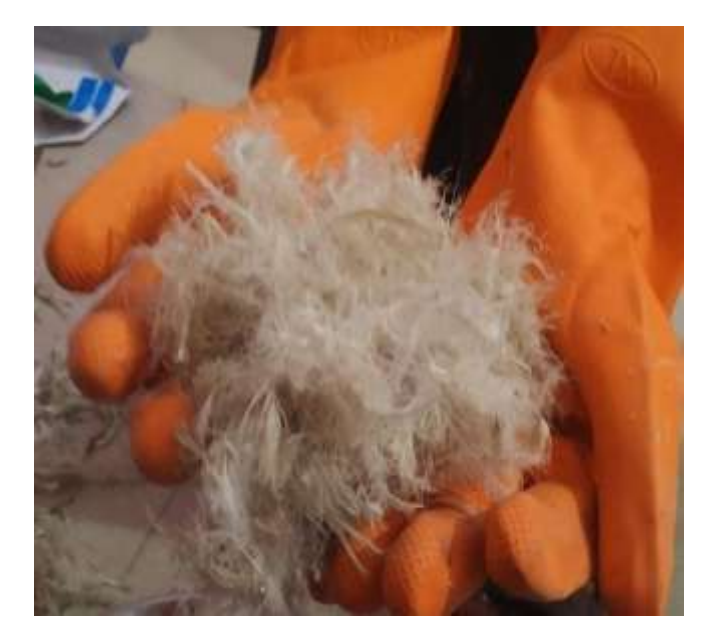
Fig 2.2: Chicken Fur

Chicken Feathers are collected from the waste dumping yards in Bhalki. After the collection of CF washed them with clean water to remove other wastes attached to them and then allowed them for drying for 2 to 3 days until the CF dried completely, after that the CF's are cut into small pieces and make them as possible as small pieces by using mechanical mixers