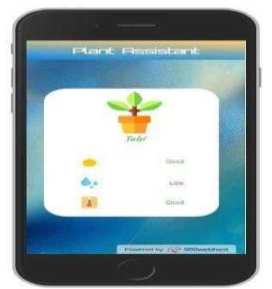
Fig -7: The android application for data monitoring.

The data received by the Cloud server is then broadcasted to the android application java script client so, that the visualization can be achieved and the user or the caretaker of the plant can easily monitor the plant growth quantities by just opening a android application. The android application features include the information about the plant which is currently being monitored by levels like good, moderate, high as shown in the figure 7.