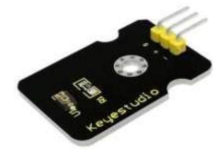
Fig -4: (TEMT 6000) Light Intensity monitoring sensor.

TEMT6000 is a sensor to measure the light intensity so that we can know how much light the plant is receiving. Sensor acts like a transistor greater the incoming light, higher will be the voltage on signal pin. It detects the light density and reflect the analog voltage signal back to Arduino controller. It mimics the human eye, it does not react well to IR or UVlight. TEMT6000 has following specifications like supply voltage range from 3.3V to 5.5V, operating temperature range 40 to 85 C and illumination range 1 to 1000 Lux.