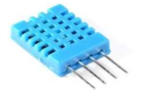
Fig -2 : DHT11 humidity and temperature sensor.

DHT11 is a Temperature and Humidity monitoring sensor using digital signal acquisition technique and temperature & humidity sensing technology. This sensor consists of a resistive type humidity measurement component and an NTC