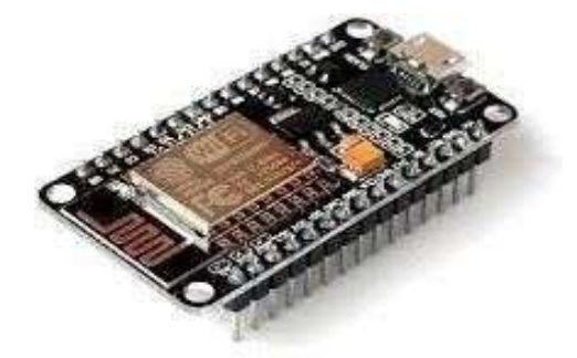
Fig -5: Microcontroller + Wi-Fi Module (Nodemcu ESP8266).