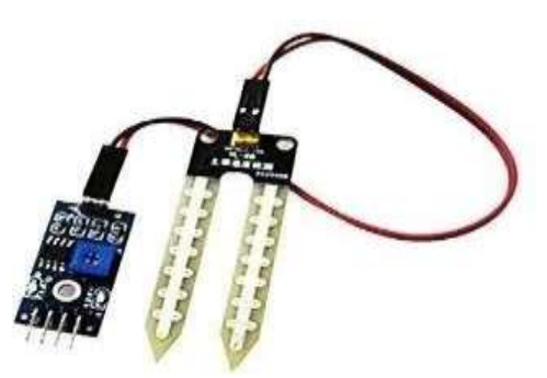
Fig -3: Soil moisture measuring sensor.

YL-38 + YL-69 is a soil moisture sensor also known as hygrometer used to detect the humidity of the soil. Which helps to monitor the soil moisture of plants or build an automatic plant watering system. The sensor is made up of two parts namely the electronic board and a probe with two pads, that detects the water content in soil. When the soil is wet the output voltage decreases and when the soil is dry the output voltage increases. The output can be a digital signal low or high, depending on the water content. If the soil humidity exceeds a certain predefined threshold value, the modules outputs low, otherwise it outputs high.