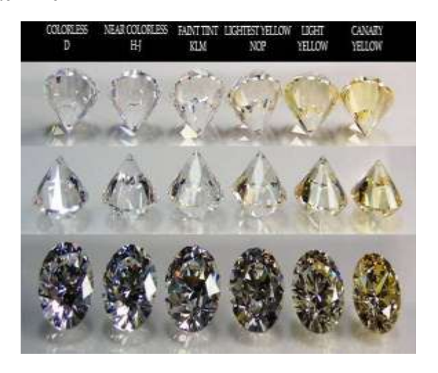
Fig 1- Diamond color grading

labouring for 60 minutes, the graders eyes regularly progress toward becoming extremely worn out, and wronged value acting can be made effortlessly. Therefore to develop an in tag rated auto-measuring system for diamond grading is becoming a challenging research topic. Proposed system works on diamond quality grading based on colors of diamond, texture of a diamond and clarity. In order to get accurate diamond images, a special hardware source is employed. Quality assessment done through three important feature extraction of the diamond like color, texture and clarity. Then extracted features are passed to the classier for grading On the basis of grading quality of a diamond will be determine.