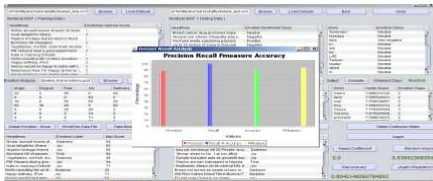
Fig No.3 : Graphical Representation of Dataset Result Analysis