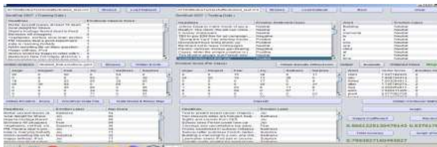
Fig No.2 :Experimental Result of Proposed Architecture