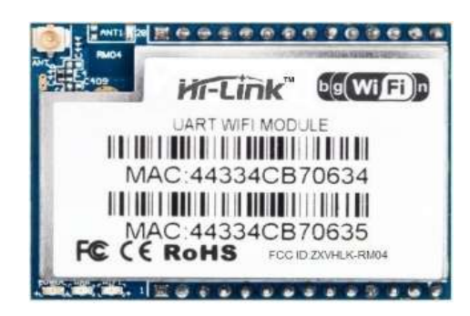
Fig -5: UART wifi Module

HLK-RM04 may be a new low-cost embedded UART-ETH-WIFI module (serial port - Ethernet - Wireless network) developed by Shenzhen Hi-Link Electronic co., Ltd. This product is an embedded module supported the universal serial interface network standard, built-in TCP / IP protocol stack, enabling the user interface, Ethernet, wireless network interface between the conversions. Through the HLK-RM04 module, the normal serial devices don't go to change any configuration; data are often transmitted through the web network. It provides a fast solution for the user's serial devices to transmit data via Ethernet.