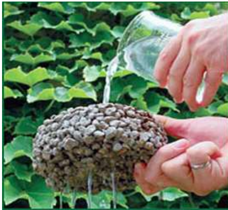
Fig.1: Seepage of water through Permeable Concrete

Pervious concrete can improve water quality by capturing the “first flush” of surface runoff, reduce temperature rise in receiving waters, increase base flow, and reduce flooding potential. The pavement creates a short-term storage detention of rainfall. In order to take full advantage of this concrete, the hydrological behavior of the pervious concrete system must be known.