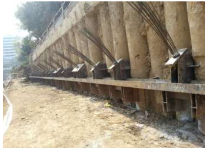
Fig -3: Wailer Beam