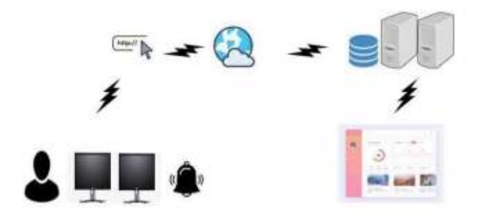
Figure 1:- System Architecture

Nowadays, a human being suffering from many health problems such as fitness problem, maintaining proper diet problem, etc. Therefore, we are developing this website for providing special dietician information and proper exercise knowledge for normal persons and for handicap people also. The effective personal dietary guidelines are very essential for managing our health, preventing chronic diseases and the interactive diet planning helps a user to adjust the plan in an easier way. The website is to be produced on Artificial Intelligence and Dietician. Here there are two persons, the admin and user. The user fills the registration form and then login to the website. After login users have to fill personal information including age, weight, height, gender and exercise level. For calculating BMI age, weight, height, gender and exercise level are necessary. On the basis of calculated BMI (Body Mass Index) Artificial Dietician will display the proper dietician for logged user. This application suggests the user to what to do for example diet tips, Exercises, Online Training, etc. Here we are included different exercises like Yoga, Gym exercises, Aerobics, Cardio, Basic workouts, etc. The user can also fire a query to the admin on his/her health-related problems to maintain his/her fitness and the admin can give solutions on user's problems.