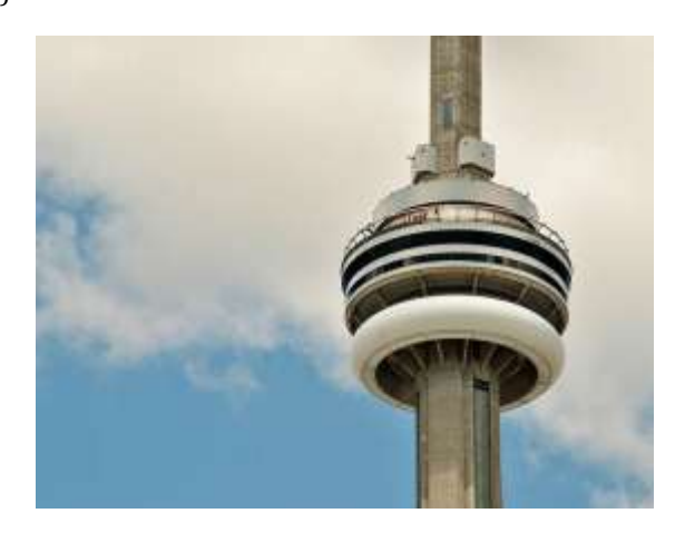
Figure 2: CN Tower in Toronto, Canada

In the world there are some structures that change their configuration. Some floors in the top of landmark buildings rotate but this is done within the structure of the building, no movement can be seen from the exterior of the structure. This has been done mainly as tourist attractions in which rotating restaurants that have a 360 degree view of a city gather a lot of attention examples of these are the rotating restaurant in the top of the CN Tower in Canada (figure 2), or the one in the top cylinder of the World Trade Center Building in Mexico City(figure 3).