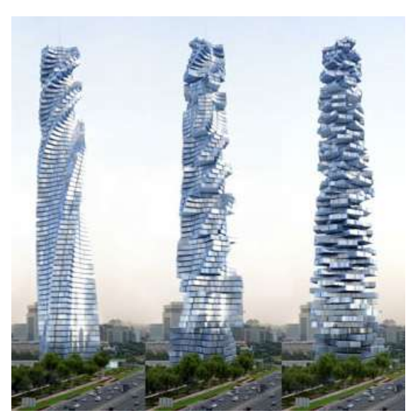
Figure 4. Structural view of dynamic tower

The only part of the tower built on site will be the skinny center core. It is strong enough to hold the floors in place, and will contain the building's elevators, which transport people and cars right to their door. Each floor will be made piece by piece in a factory in Italy—a throwback to Fisher's previous life in prefabricated