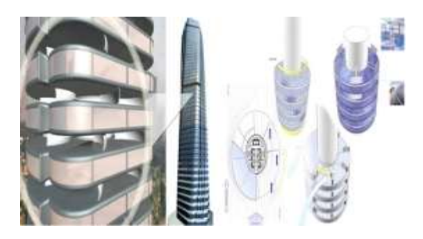
Figure 1: Designing concept of dynamic tower

skyscraper for Dubai powered by wind turbines placed between each floor as shown in figure 1. Each floor rotates separately, meaning the building's profile will constantly change. This building will be able to generate electric energy for itself as well as for other buildings. Forty-eight wind turbines fitted between each rotating floors as well as the solar panels positioned on the roof of the building will produce energy from wind and the sunlight, with no risk of pollution.