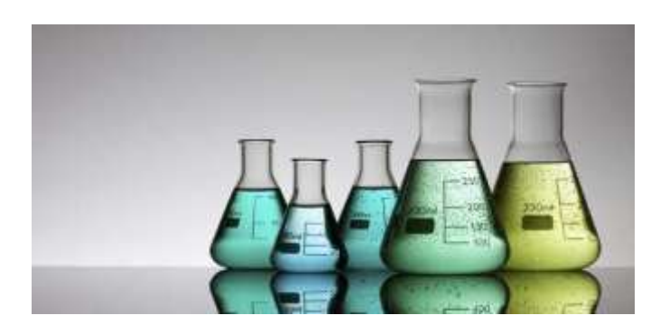
Fig -1: Chemicals