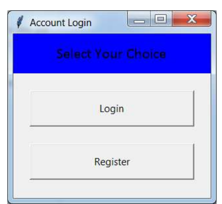
Fig -1: Start page

This module is required for the user to register on the system. A successful registration generates a confirmed identity to be saved in the database of the system.