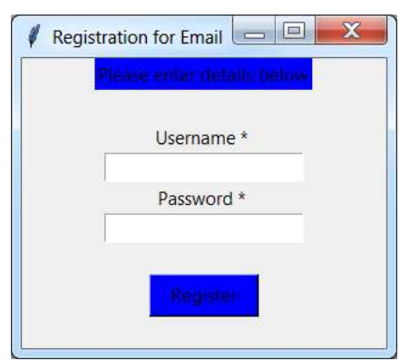
Fig -2: Registration page