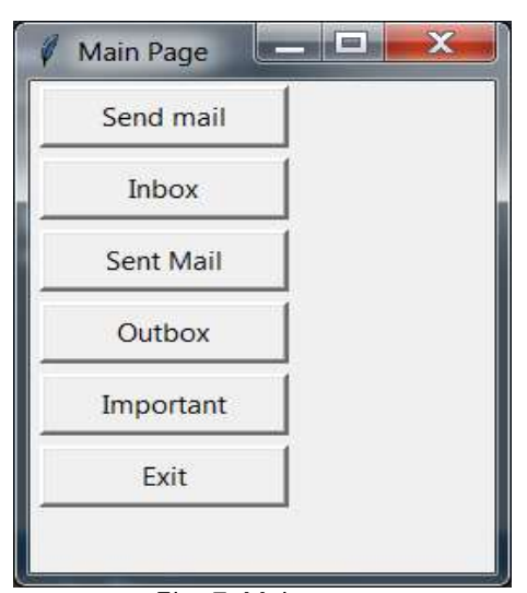
Fig -7: Main page

Volume: 07 Issue: 01 | Jan 2020 www.irjet.net p-ISSN: 2395-0072