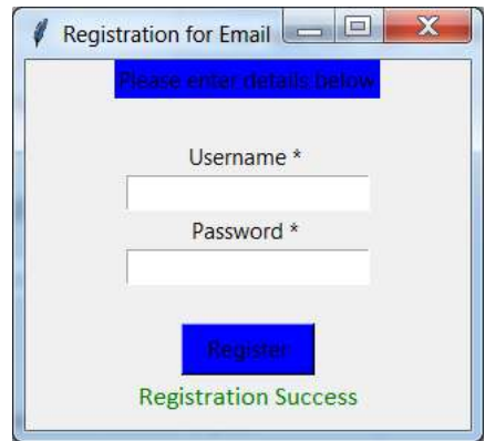
Fig -3: Confirm registration page