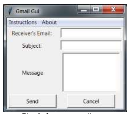
Fig -8: Compose mail page

This is also a crucial module in the system which determines and maneuvers conversion of user's voice to text and point out misconceptions if any to perform a systematic mode of communication as per user's will/concern.