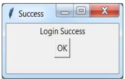
Fig -5: Confirm login page

A positive login leads to this page where the user will be given further instructions on the initial attempt. It also acts as a module to authenticate the credentials via encryption/decryption of entered data.