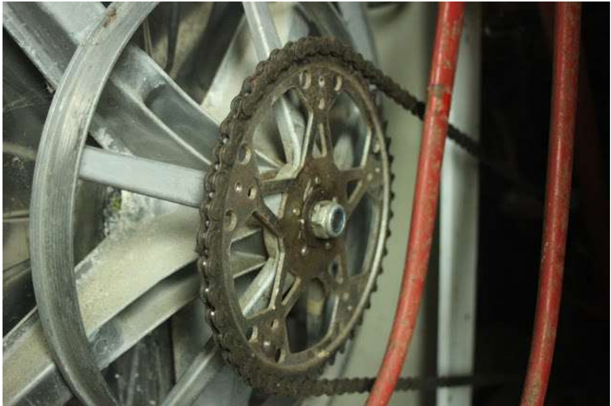
Fig. power transmission