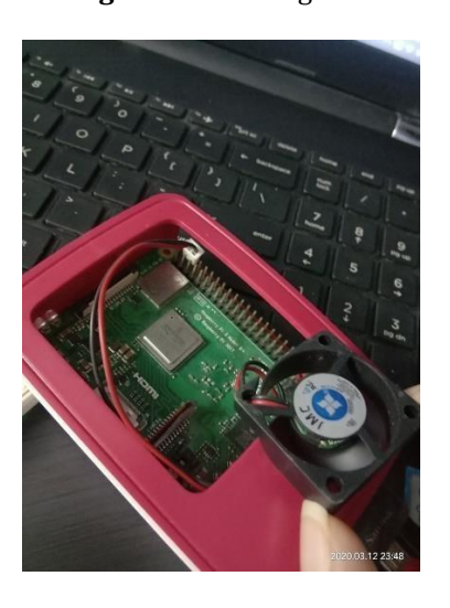
Fig4: Raspberry Pi