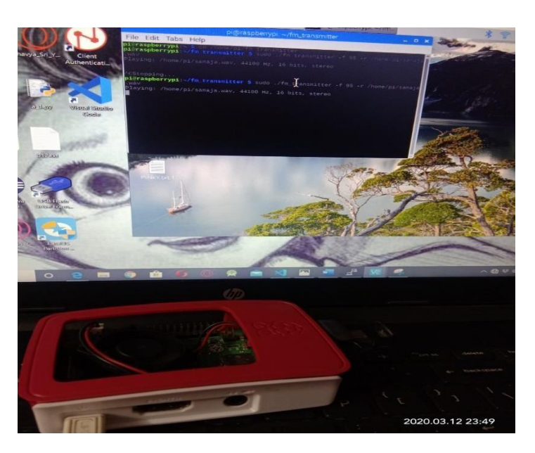
Fig2: Output screen

Outcome: Outcome is the well-established low-cost radio station at VR Siddhartha.