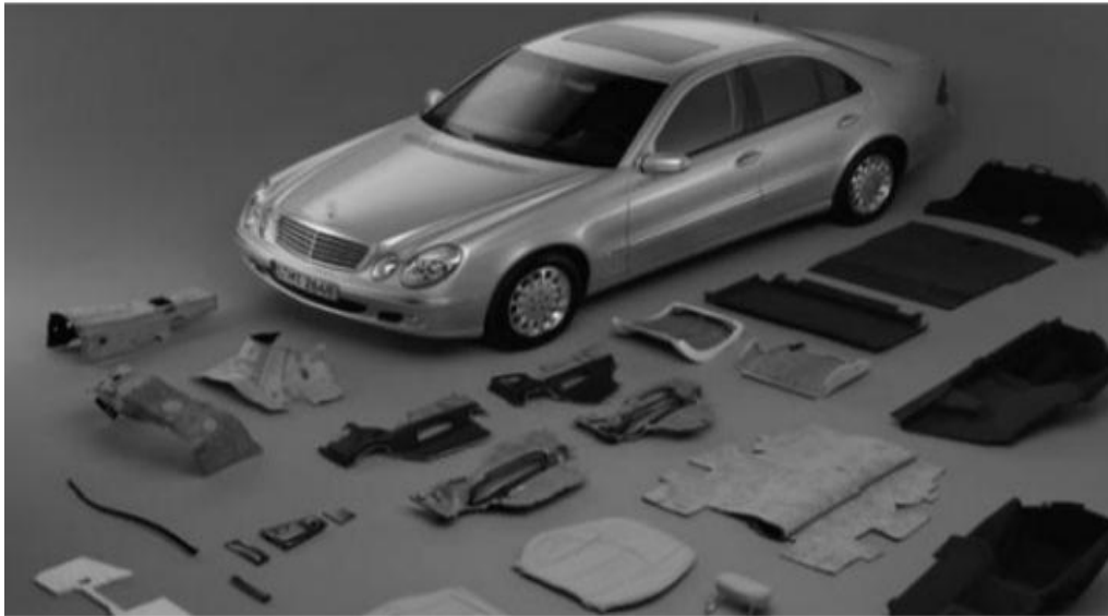
Mercedes Benz E class components ( figure 1 )

Perfect example for how to make a most use of natural fiber based composites is recent Mercedes S-Class vehicle which has around 25 components made from these natural fibers based polymer composites which weighs around 40 kg, which is effective usage of natural fiber based composites.