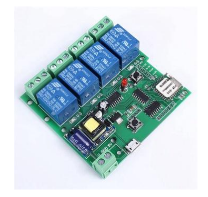
Figure 4: 4 channel Wi-Fi relay

Wi-Fi relay helps us in controlling different devices and gadgets of our home via Wi-Fi. This controlling can be done directly with the help of mobile application. These relays are categorized as 4 channel relay, 6 channel relay, 8 channel relays for the type of usage and number of appliances the user want to control.