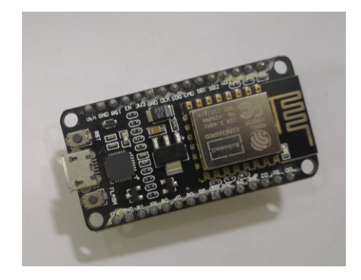
Figure 1: ESP8266 Microcontroller

NodeMCU is an open source firmware which is developed for ESP8266. Since it is an open source platform, the hardware design can be modified according to the type of usage. The main microprocessor, ESP8266 also has an inbuilt Wi-Fi functionality and can be connected to any mobile phone.