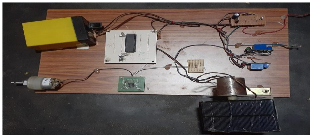
Fig - 2: Hardware module of Proposed system