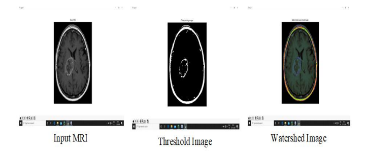
Figure 4.4.1: Final result of input MRI.

The dataset accumulated from online publically available dataset and also the Tensor flow environment used for development process. Input image undergoes for pre-processing stage including the testing process. Thereafter the pre-processing image enhanced and extracted by using deep convolutional neural network framework with VGG16 model. Then the tumor classified image is retrieved.