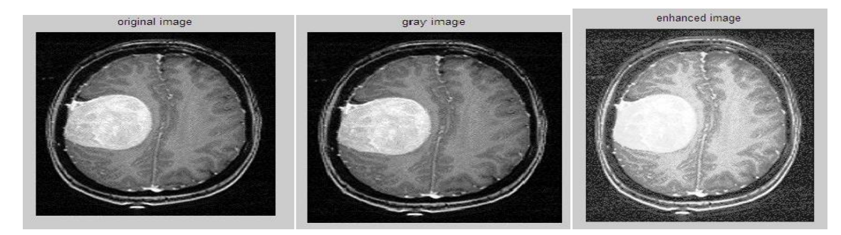
Fig.3: (a) input image (b) gray image (c) enhanced image

the test image "ROI and NROI part of the medical image" as shown in below Table-6.1 illustrates compressed image quality with different coefficient factor and PSNR, MSE, cR and BPP is calculated.