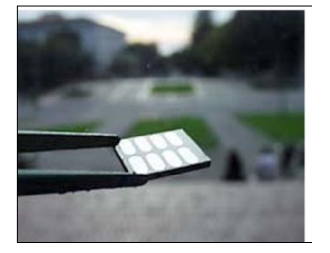
Fig-3 Solar cell unit

Their Power Sheet cells contrast the current solar technology systems by reducing the cost of production from $3 a watt to a mere 30 cents per watt. This makes, for the first time in history, solar power cheaper than burning coal. These new plastic solar cells utilize tiny nanorods dispersed within in a polymer. The nanorods behave as wires because when they absorb light of a specific wavelength, they generate electrons. These electrons flow through the nanorods until they reach the aluminum electrode where they are combined to form a current and are used as electricity [14],[15].