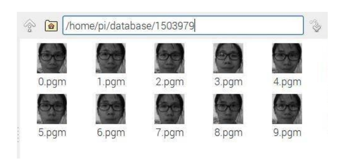
Fig 4. Sample images taken through the system's pi camera