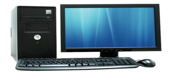
Figure 1: Computer

A computer with processor Intel i3 or above and minimum ram capacity of 2Gb is required for smooth and fair operation of the project