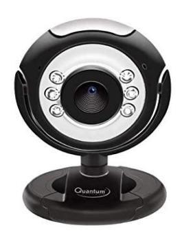
Figure 2: Web camera

A webcam is a video camera that feeds or streams an image or video in real time to or through a computer to a computer network, such as the Internet. Webcams are typically small cameras that sit on a desk, attach to a user's monitor, or are built into the hardware. In case of a laptop it is inbuilt for most of them.