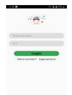
Fig -2: Login form

This is a login page for the existing user where the user have to verify mobile number then the OTP will be send to user's mobile number which user should enter on login page. On successful verification of mobile number and OTP user will be able to login to the application as shown in fig 2.