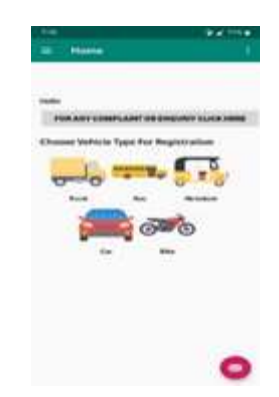
Fig -4: Vehicle index page

On vehicle index page there are options to choose vehicle type from available types such as: truck, bus, car, bike and rickshaw. Choose the vehicle you want to register from fig 4.