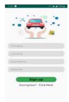
Fig -3: Sign up page

Sign up page is designed for the new user. Sign up page consists of fields: first name, last name, email id, mobile number as shown in fig 3. On clicking sign up button all the user details will be stored in database and user will be redirected to the login page.