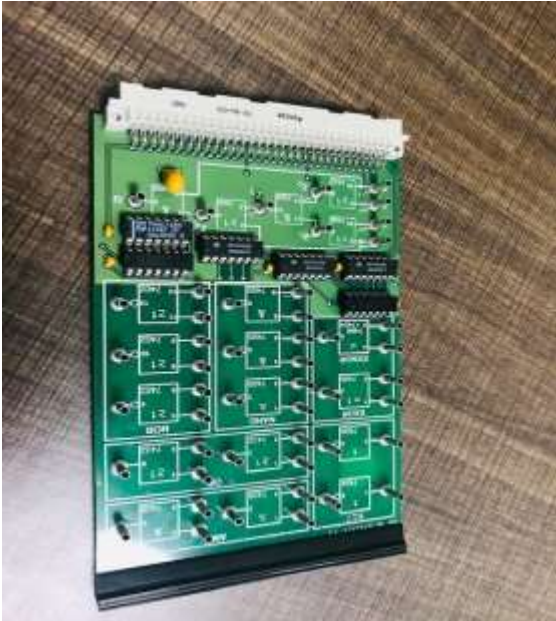
Fig -1: IC circuit

The circuit shown above has all the components required for a 7805 IC to work properly. The capacitor (0.22 \mu F) near the input is required only if the distance between the regulator IC and the power supply filter is high. Additionally, the 0.1 \mu F capacitor near the output is optional and if it is used, it helps in the transient response.