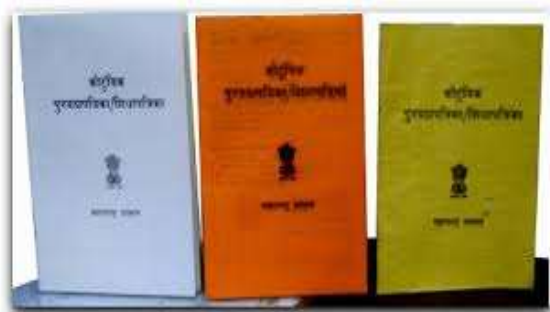
Figure -1: Types of Ration Card