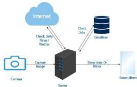
Fig -1: System Architecture Diagram