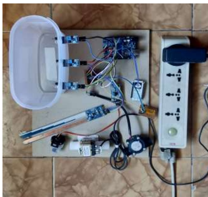
Fig-4 Connection Diagram

The sensors sense the data and them transmits to the Arduino UNO. These data are transmitted to ESP8266. The ESP8266 pushes the data through MQTT. The MQTT (Message queuing telemetry transport) program is dumped in ESP8266. The threshold condition checking is done in both Arduino UNO and ESP8266. The decision-making process is first done in Arduino because the solenoid valve is connected to Arduino UNO only then the condition to close the valve will be received. Then the decision making also done in ESP8266 to alert the user that the threshold of the water is triggered by any of the sensors. This allows the user to view the alert only when threshold is triggered rather than receiving all the sensed values. The user can view the message with an MQTT app installed in his device. The ESP8266 should be connected to Wi-Fi and the details are stored in program. The user can subscribe to the topics that has been configured for each sensor. The alert to user and valve closing is done simultaneously.