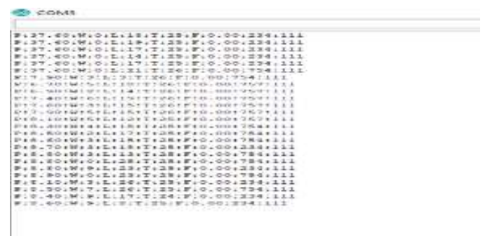
Fig-5.1 Output on Arduino Serial Monitoring