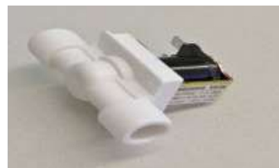
Fig-3.7 SOLENOID VALVE