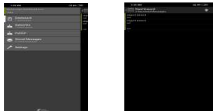
Fig- 5.2 Output on MQTT