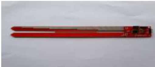
Fig-3.4 ROBODO SEN18

Robodo sen18 is used to measure the level of water in a container(tank). Its working voltage is 3-5V, current is <20mA and sensor type is analog detection.