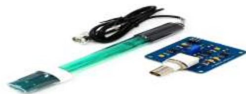
Fig-3.2 pH Sensor

PH sensor senses the potential of hydrogen in water. The pH ranged from 0 to 6.9 indicates the acidity, 7 is neither acidic nor alkaline and 7.1 to 14 indicates alkalinity of water. The lesser the value the more acidic the water has become and the higher the value more alkaline the water has become. This sensor uses a input supply of 5.5 volt.