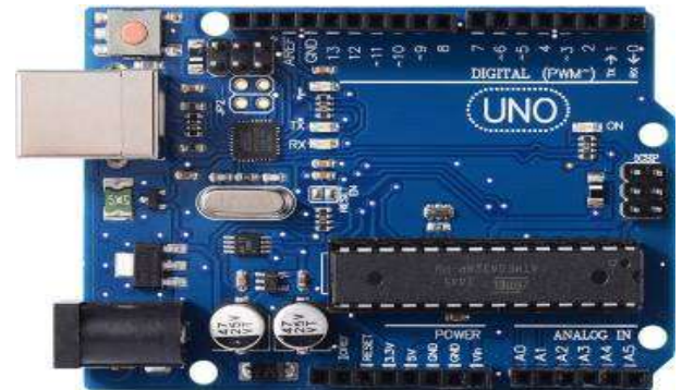
Fig-3.1 Arduino UNO

The Arduino Uno is based on the ATmega328 and it is microcontroller board. It has 20 virtual input/output pins (of which 6 may be used as PWM outputs and six may be used as analog inputs), a 16 MHz resonator, a USB connection, a strength jack, an in-circuit machine programming (ICSP) header, and a reset button. It incorporates the whole lot had to guide the microcontroller; genuinely join it to a laptop with a USB cable or power it with an AC-to-DC adapter or battery to get commenced. Microcontrollers and your widespread motive laptop are the sheer amount of memory available. The Arduino UNO has simplest 32K bytes of Flash reminiscence and 2K bytes of SRAM.