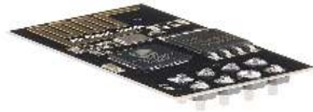
Fig-3.5 ESP 8266

ESP8266Wi-Fi is enabled with an on chip (SoC) module and employs a 32-bit RISC CPU based on the Tensilica Extensa L106 running at 80 MHz (or overclocked to 160 MHz). It has a boot ROM of 64KB, 64 KB instruction RAM and 96 KB data RAM. External flash memory can be accessed through SPI. The working voltage is 3.3V.