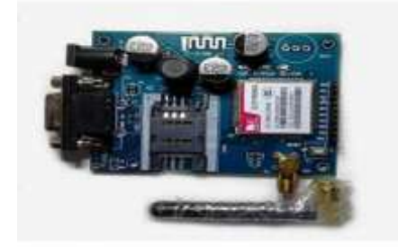
Fig-6: GSM Module

The abbreviation of the GSM is Global System Mobile Communication. It is used to generate the auto call to authorities whenever the fire is detected by the robot, so that the damages can be reduced [4]. In this project the auto call will be send to three people such as Fire Station, Police Station and the owner of the industry. The call will be sent one after another within the time interval of fifteen seconds.