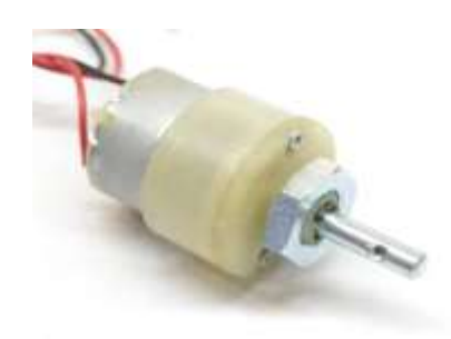
Fig-7: DC Motor

The DC Motor is used to drive the robot from one place to another. The motor required power supply is 4 to12 volts and it provides 100 RPM at 12 volts. Therefore two DC motors are used to drive the robot.