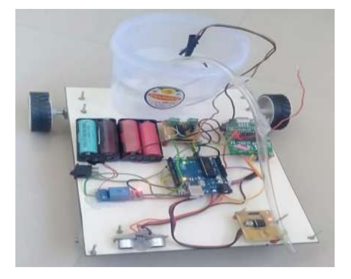
Fig-8: Top view of proto type system

Ardunio Uno the power is distributed to all other components. The output pin of the flame sensor is connected to the eighth pin of the Ardunio Uno. Each component are connected and controlled by the Ardunio.