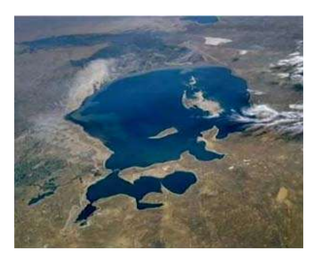
Figure -1a: SHRINKING OF ARAL SEA (1985)

RJET Volume: 07 Issue: 03 | Mar 2020 www.irjet.net p-ISSN: 2395-0072