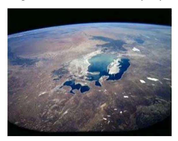
Figure -1b: SHRINKING OF ARAL SEA (1997)