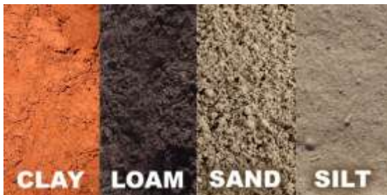
Fig-3: Different types of soils for planting

On the basis of dominating particle size, soil can be classified as peat, clay and sand. Some soils can be further classified as combination of two soils such as clayey peat, clayey sand, sandy clay, humus clay, silty sand etc.