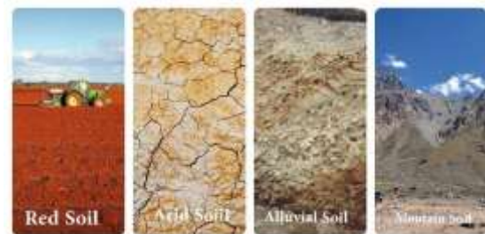
Fig-2: Types of soils in India

Based on the location, soils can be classified into red soil, black soil, forest soil, alluvial soil, laterite soil, arid or desert soil, peaty or marshy soil etc.