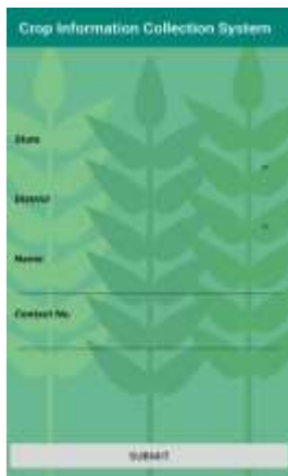
Fig -2: Front page of crop information system