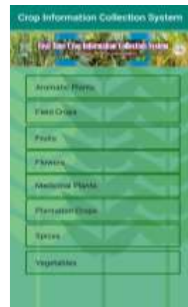
Fig -4: Selection crop type for collection information through crop information system

This is the main form that consists of crops for selection. Crop types are available for a selection of a particular crop. Once the user selects any crop it will generate a form that is available with some important parameters. Users must fill the form and response is captured. These parameters help organizations and farmers to know about the yield. The same crop with different information varies from area to area.