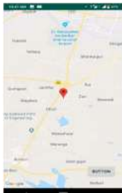
Fig -3: Collection of location details through crop information system

Map access is based on the previous module that is location detail. Once location details are filled and the user submits it, then it will jump on the next page which is map access, the map will locate the farm area. This part of the application is very important as it will authenticate the location of the farm.