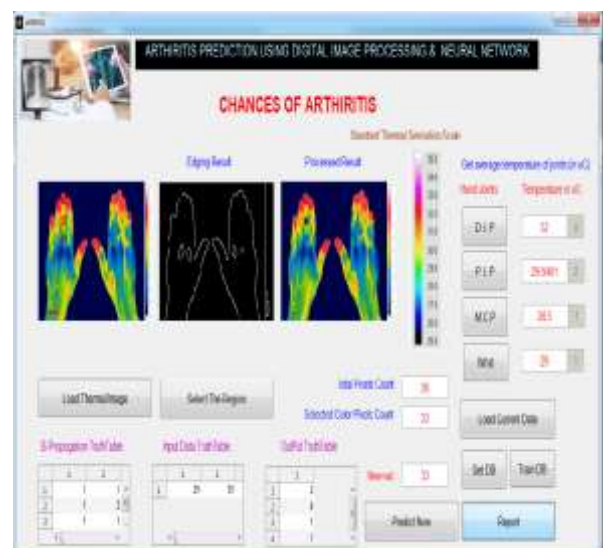
Fig -3: Output of work

In this project, we need thermal image to load and process it. Then, select region of joints. Here, we have taken four joints of hands i.e. Distal interphalangeal joint (DIP), Metacarpophalangeal joint (MCP), Proximal interphalangeal joint (PIP) and wrist. Select the region of the particular joint one by one and click on the button of the respective joint. The arthritis can be happen in any one of the joint or number of joints. So, if any one of the joints having chances of arthritis then the result will be chances of arthritis otherwise it would be normal case. The thermal range is 29°C-32°C for arthritis patients.. The output is shown in fig 2.