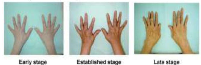
Fig -1: Stages of arthritis patients