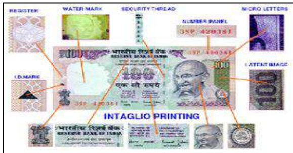
Figure.1. Security Features of Indian Currency

viii. Identity Document: Each note has its own unique identifier. There are various instances of different branding tags (Rs.200-H, Rs.500-square and Rs.2000- Square). A type of identification is located to the left of the water sign.