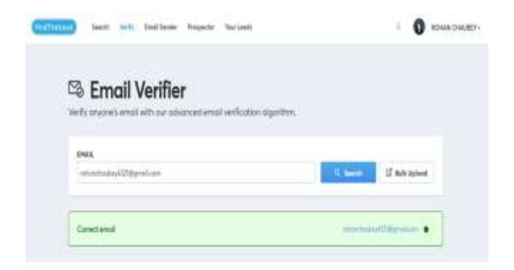
Fig 7.2 email verification system

In Figure 7.2 shows a email verification service (also available via API). It checks the data and determine whether the emails are correct or incorrect.