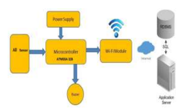
Fig 1 -: Block Diagram

The mobile application named arduino Bluetooth Control which monitors car via Bluetooth connectivity the system contains sensor for detection of gas, temperature and humidity. Gas sensor detects gas range if there is a leakage in gas the sensor will on the car will detect it and it will make a noise (like buzzer) which will make the people aware and can take safety precaution.