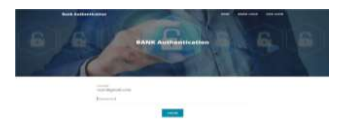
Fig -2: User Login

© 2020, IRJET | Impact Factor value: 7.34 | ISO 9001:2008 Certified Journal | Page 1822