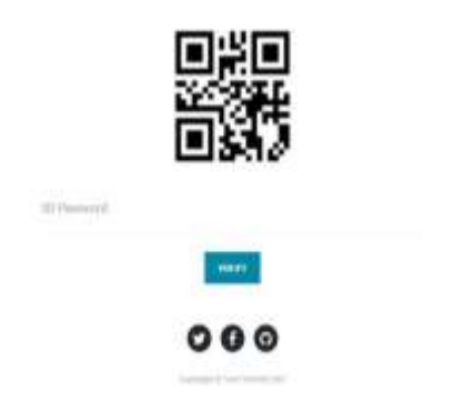
Fig -3: QR code generation