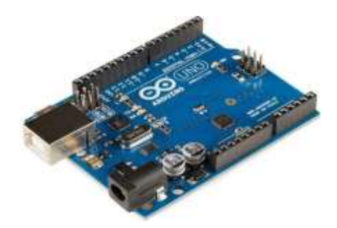
Fig-2 Arduino UNO

The Arduino is a microcontroller board based on ATmega328. It has 14 digital input/output pins(of which 6 can be used as PWM outputs), 6 analog inputs, a USB connection and a reset button. It contains everything needed to support the microcontroller; simply connect it to a computer with a USB to get started.