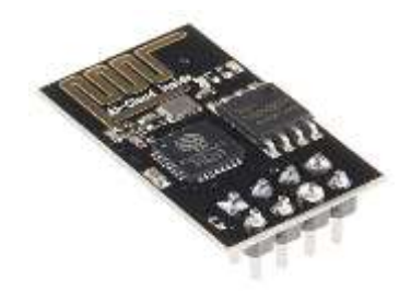
Fig-3: ESP8266 Wi-Fi Module

ESP8266 is a low-cost Wi-Fi microchip, with a full TCP/IP stack and microcontroller capability, produced by Espressif Systems in Shanghai, China. It is capable of either hosting an application or offloading all Wi-Fi networking functions from another application processor.