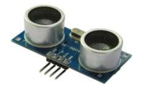
Fig-5 Ultrasonic Sensor

This sensors determines the distance to an object by measuring time lapses between the sending and receiving of the ultrasonic waves.