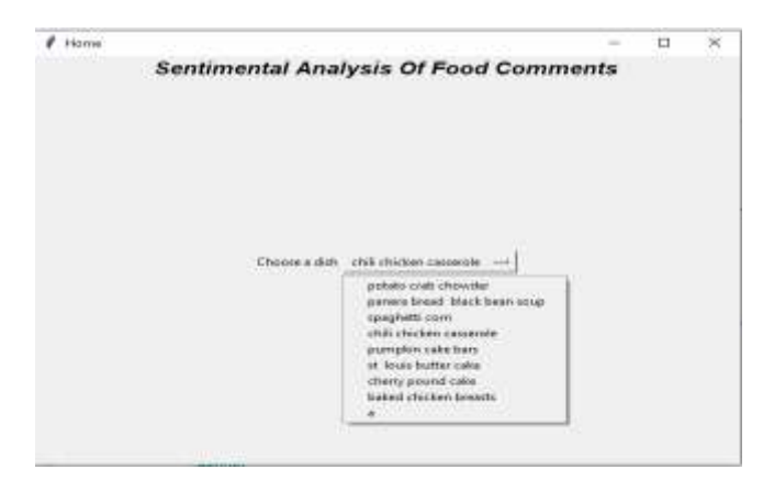
FIG 2: Input

In this experiment we have used amazon fine food reviews to train the model. It contains 5,68,454 reviews for 74,258 recipes. For experiment purpose we have used 2,00,000 comments for 3000 recipes. We have created a user interface where user select a recipe name for which we wants to observe the analysis of reviews. After submitting they can observe a pie graph with number of positive and negative comments for that recipe.