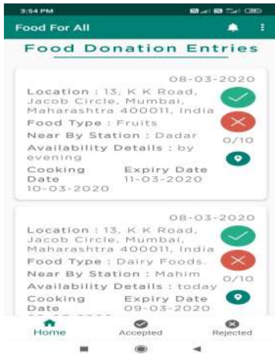
Fig 5.5 Food Donation Entries