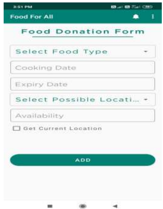
Fig 5.4 Food Donation Form