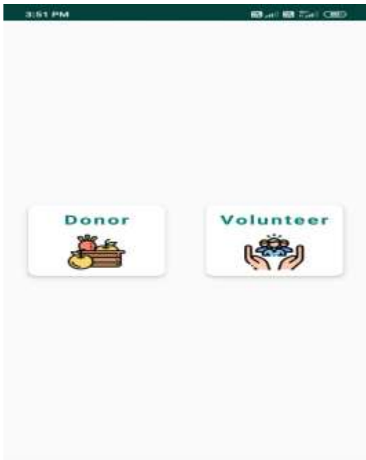
Fig 5.2 Signup as Donor or Volunteer