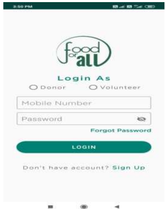
Fig 5.3 Login as Donor or Volunteer