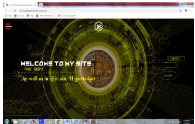
Fig-2 Welcome page of the application